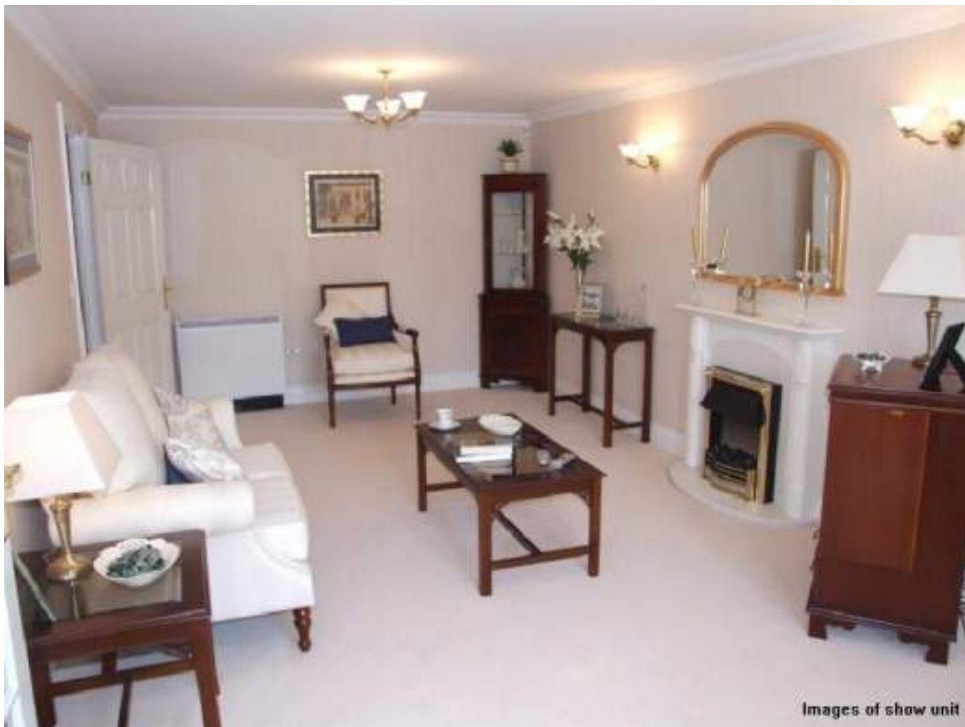
Images of show unit